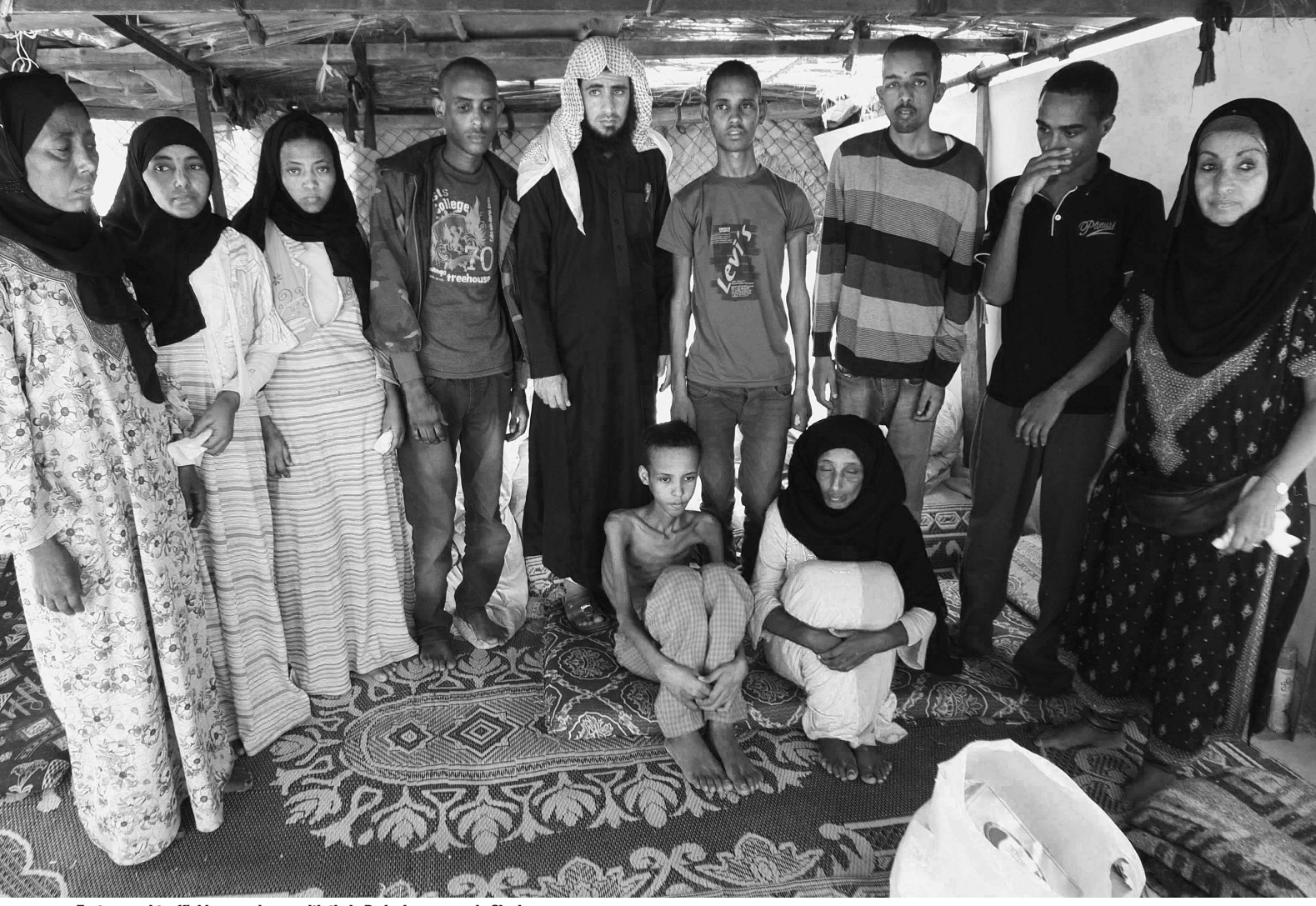
Torture and trafficking survivors with their Bedouin rescuer in Sinai