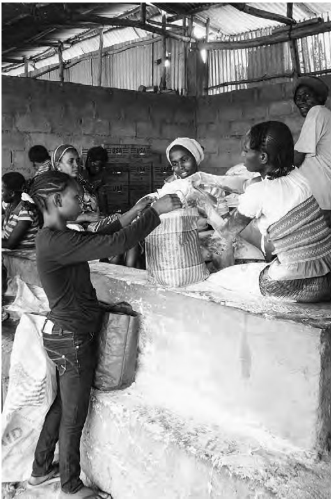
Distribution of UNHCR supplies in Shimelba camp, Ethiopia.