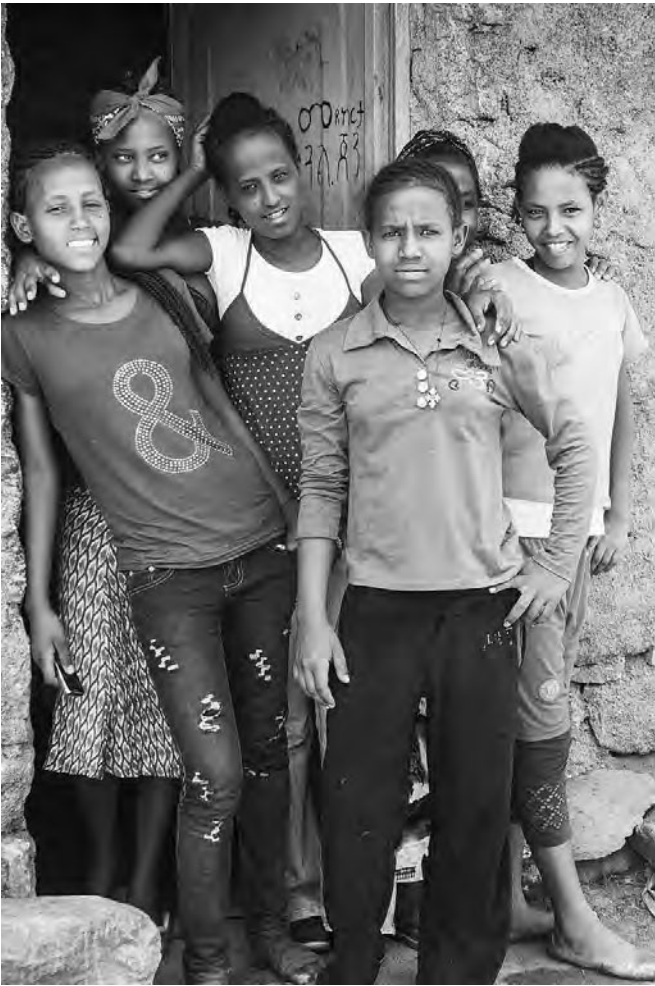
Hundreds of unaccompanied minors live in a special section of Mai Aini camp, Ethiopia.